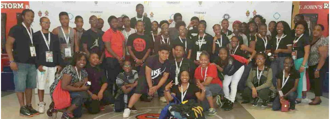
The Sacred Heart Youth with their leaders and chaperons during the Steubenville Youth Conference 2016 in St. John's University.