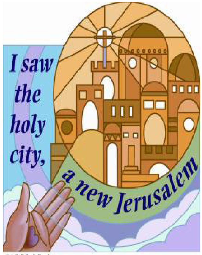
O J. S. Palueh Co., Inc.