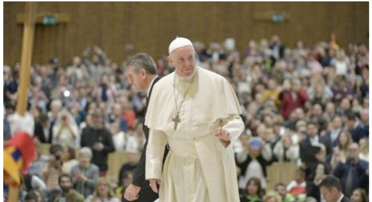
Pope Francis arrives in the Paul VI Hall for Wednesday's General Audience

https://www.vaticannews.va/en/pope/news/2018-12/pope-at-audience-during-advent-ask-jesus-to-teach-us-to-pray.html