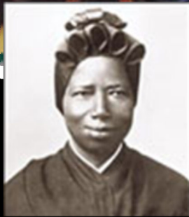
St. Josephine Bakhita