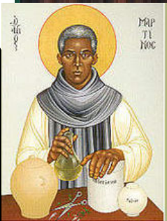
St. Martin de Porres