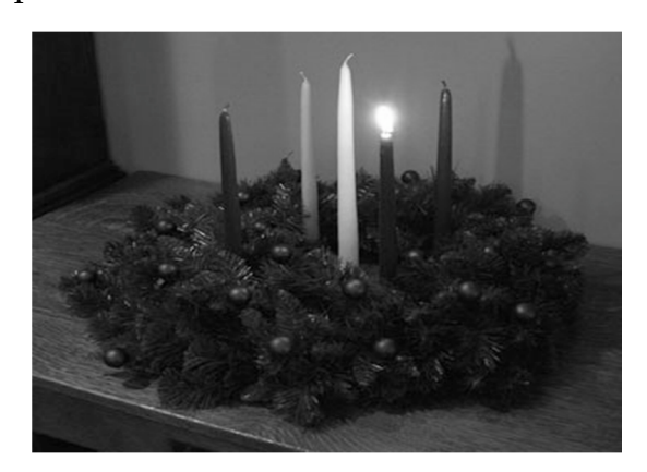
Today we focus on the coming of Christ as our Shepherd.

By lighting one candle each week of Advent, we help ourselves get ready for the birth of Jesus. The candles have different meanings, each based upon the Bible. These meanings help us understand how special the birth of Jesus is for us.