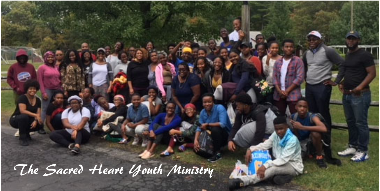
The Sacred Heart Youth Ministry

Thank You ... our dear Sacred Heart Family for your love and support!!!